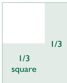
1/3 pages 4 3/4" x 4 3/4" (sq.) 2 1/4" x 9 3/4" (vert.)