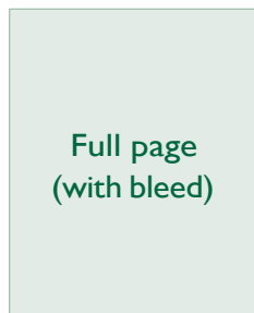
Full page & covers 8 5/8" x 11 1/8" (trim) 7 7/8" x 9 3/4" (live)