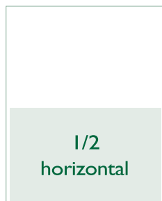
1/2 horizontal 7 7/8" x 4 3/4"